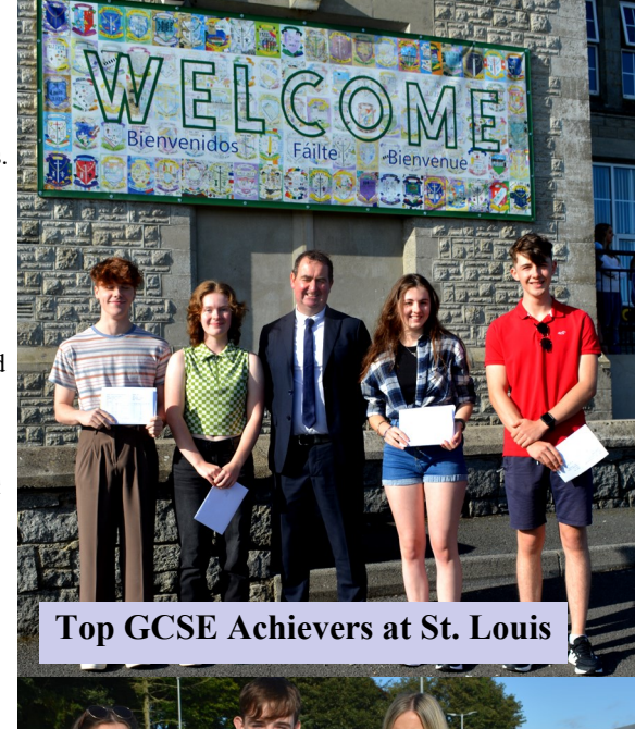
GCSE Success at St. Louis Use that time of war again when there is a large many a gray dang rature to their alarge many.

With the new academic year commencing almost immediately, the majority of these students will continue their studies at AS/A2 Level and BTEC Level 3, at St. Louis. "Their GCSE success has laid down a strong cornerstone from which they can further develop their abilities along a variety of career paths from the many AS/A2 subjects offered at St. Louis Grammar School," he concluded.