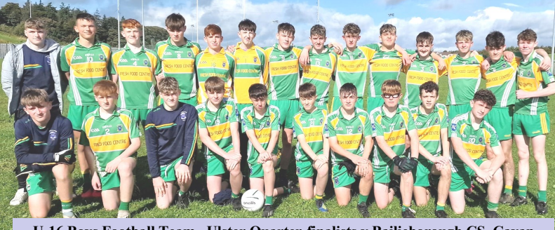
U-16 Boys Football Team- Ulster Quarter-finalists v Bailieborough CS, Cavan